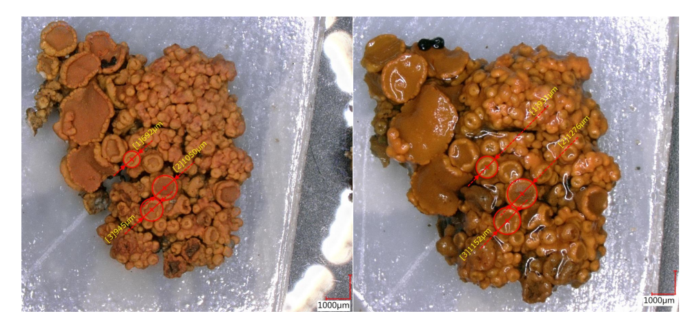
Fig. 2. Dry (left) and wet (right) thallus of Xanthoria elegans with indication of apothecium diameter using a software tools. An example shows 3 particular apothecia oriented in a plane rependicular to the optical axis of a microscope. Particular diameters are indicated on the photographs as red circles and their numerical values reported in yellow characters.

Although many studies have been devoted to water holding capacity (Gauslaa et Solhaug 1998, Merinero et al. 2014), maximum storage of water and surface to volume ratio (Snelgar et Green 1981) in hydrateted lichens, only little attention has been devoted to size and voluntometric changes in lichens upon hydration of thallus. In lichens with fruticose thallus anatomy, however, the study of Esseen et al. (2015) addressed this problem and related