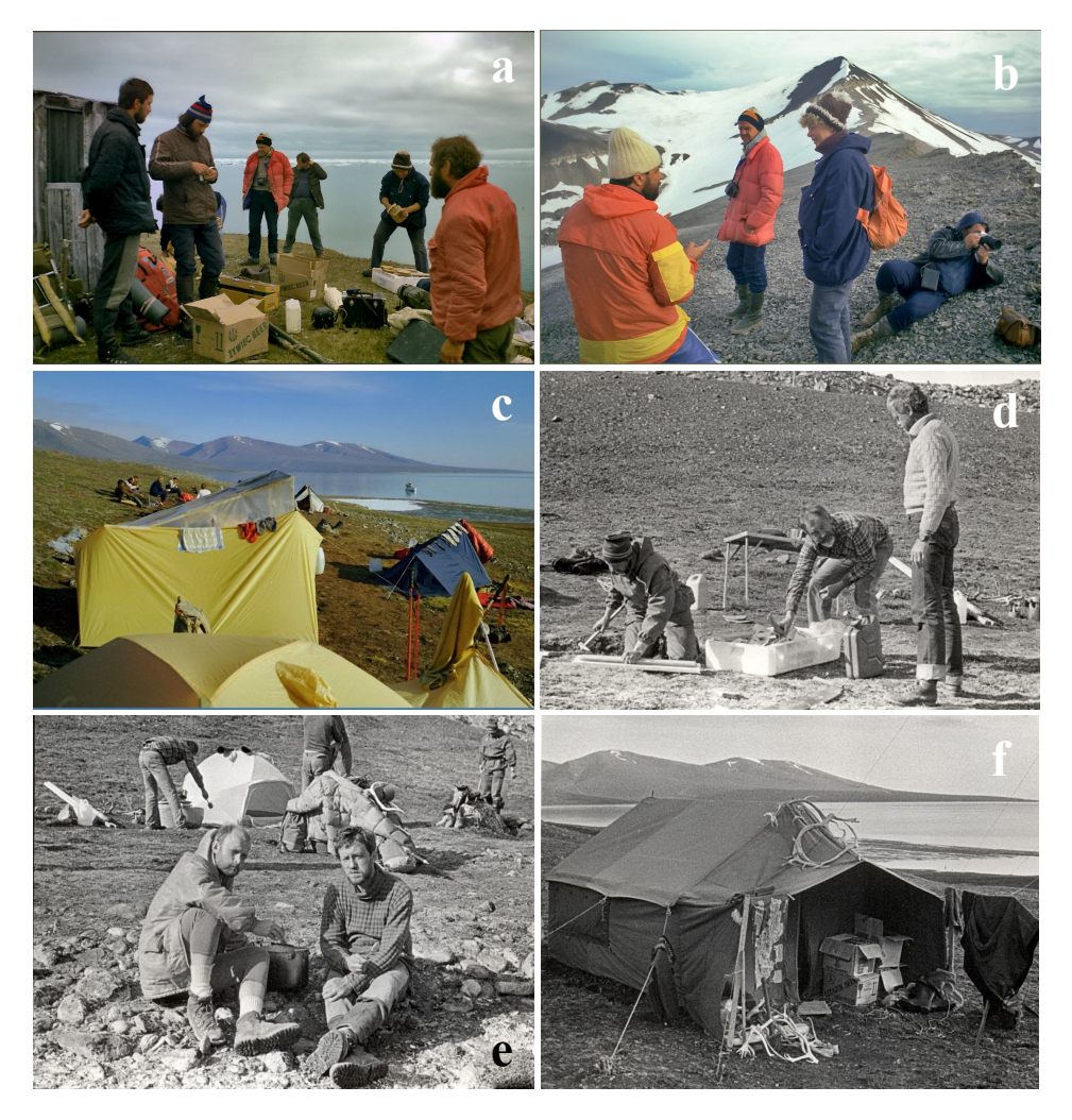
Fig. 2. a-c: Expedition "Svalbard 1988", d-f: Expedition "Svalbard 1988 - retro".

Meodden and Agardhdalen, Rosenbergdalen, Sassendalen and Adventdalen and other localities (closer information in Jankovská 1994).