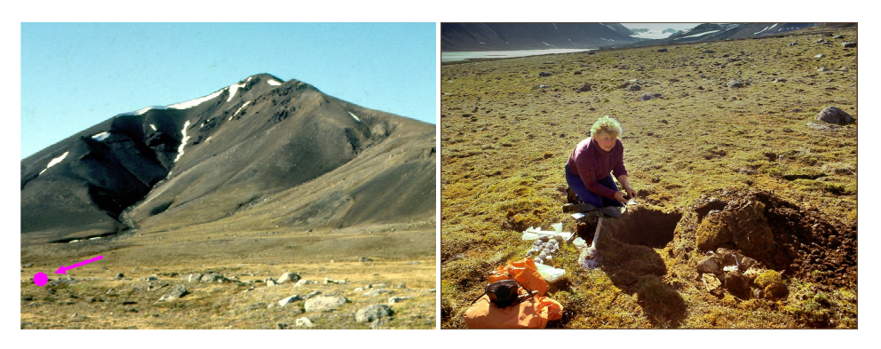
Fig. 3. a: Localization of our profile, b: Sampling from open pit.

was also observation of the vegetation in these climatically extreme and demanding conditions. We studied here the different conditions of changes in terrain, hydrology, amount of sunlight, nearness of permafrost, influence of erosion and fauna in this environment of High Arctic landscape. The aim of this observation was to specify palaeoecological interpretation of pollen analytical results from the sediments of glacial age originating from Central Europe.