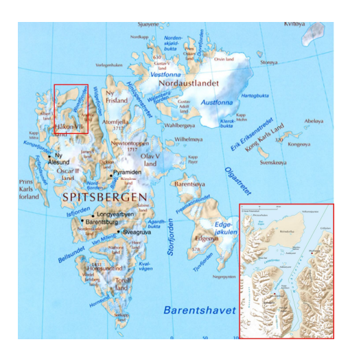
Fig. 1. Svalbard - area under study.