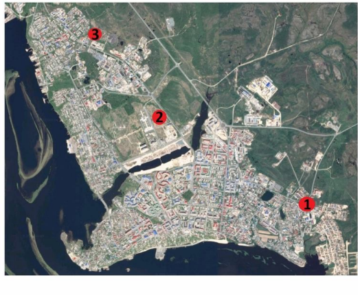
Fig. 1. Location of Salekhard on the map of Yamal region and sample sites. 1 - Sal1; 2 - Sal2; 3 - Sal3.

The soil cover of natural environments in surroundings of Salekhard is characterized by predominance of Histic Gleysols and Aquiturbic Cryosols in hydromorphic positions of the landscape and Podzols in autonomous positions (Alekseev et al.