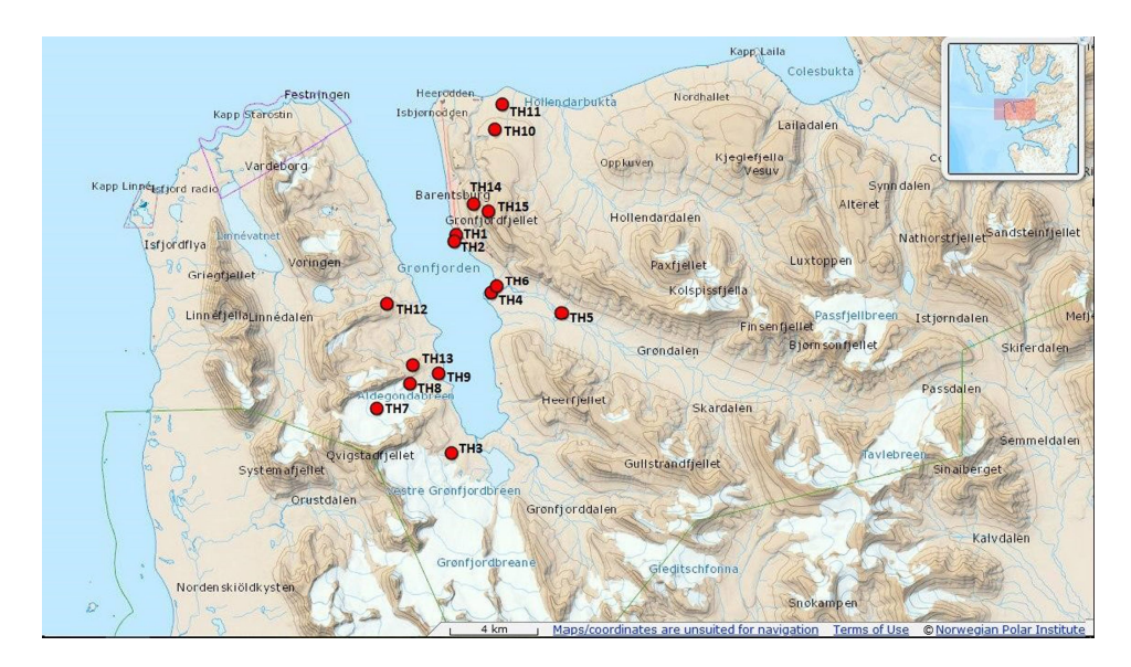
Fig. 1. Locations of the 15 soil pits.

(TH 3, 8, 9, 13); river terraces affected by cryogenic processes (TH 4, 5, 6); erosional terraces on the mountain slope (TH 14, 15).