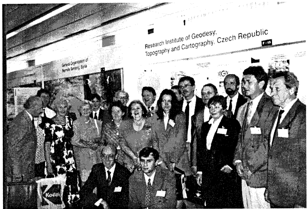
Czech participants of the 18 th ISPRS Congress in Vienna

44 Congress resolutions state the present situation in photogrammetry and remote sensing and bring recommendations for future development of this scientific branch in next four years. It was stated that the participation of our country is generally valued as positive and that our representatives from the scientific branches of photogrammetry and remote sensing keep pace with global progress.