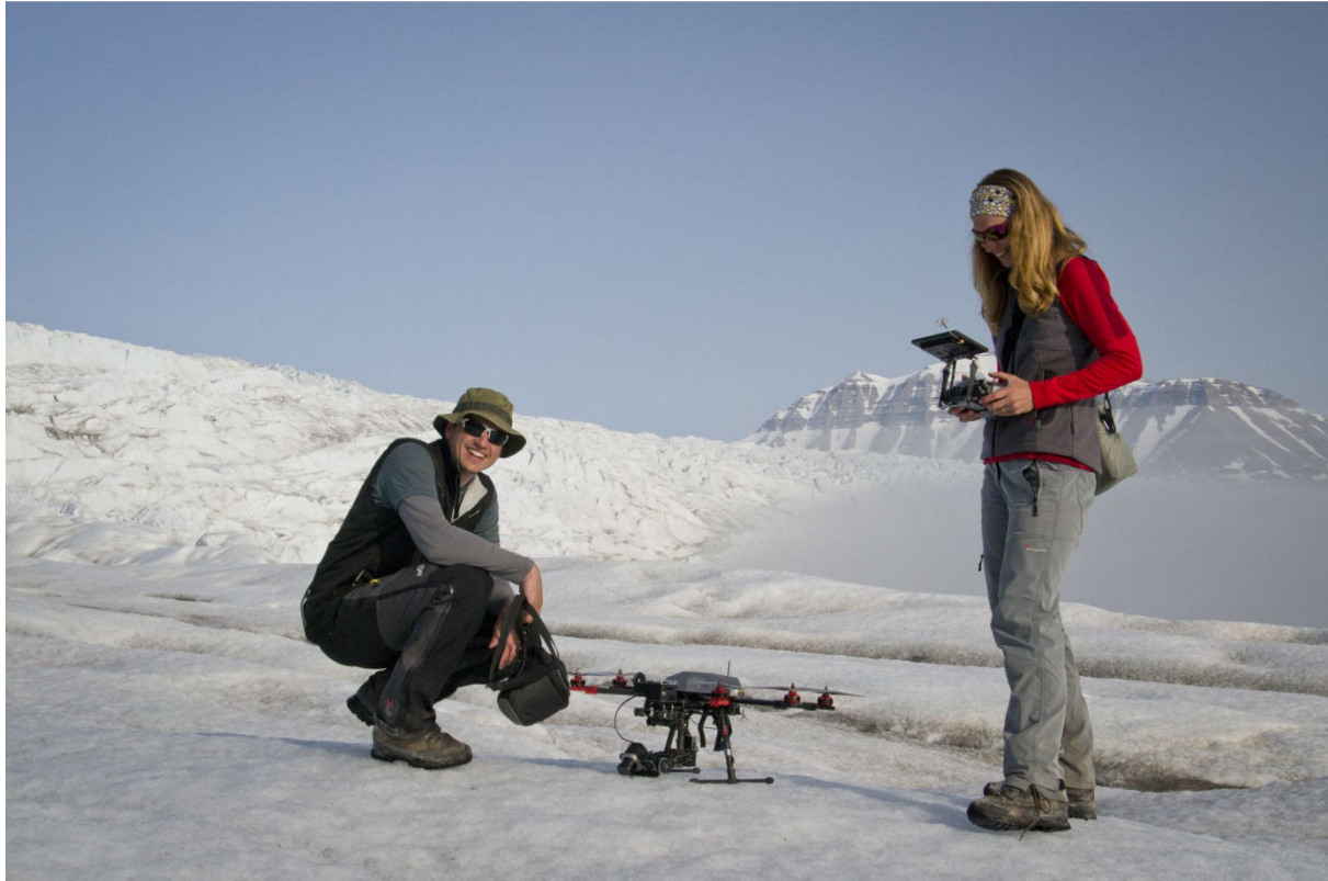
Preparation for geodetic survey using the unmanned aerial vehicle (drone) on Nordenskiöldbreen glacier.

4) Investigation of glaciers and their spatial changes was focused on four glaciers located in the Petuniabukta area. There were differential GNSS measurements of the glacier surface, as well as position and height measurement of ablation stakes installed in previous years, performed on Bertilbreen, Ferdinandbreen and Elsabreen glaciers. The obtained data will provide basis for the calculation of areal and volumetric changes of the glaciers. Finally, a remote sensing survey of the marginal part of Nordenskiöldbreen using the unmanned aerial vehicle (drone) was undertaken in order to create an actual elevation map to study glacier fluctuation and mass loss changes as a result of air temperature rise in the Arctic.