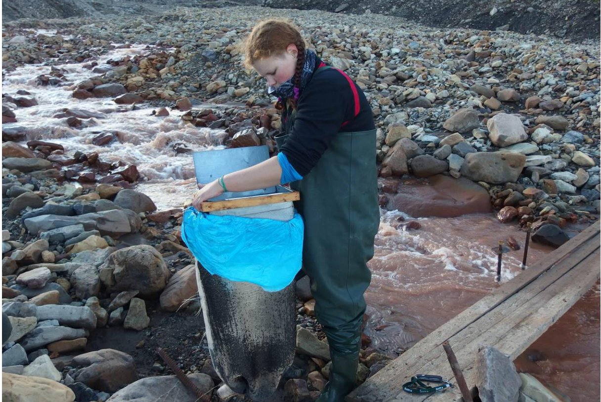
Bedload sampling in a glacial stream of Elsabreen.

4) Multitemporal changes of the Bertilbreen and Elsabreen braidplains using total station surveying, differential GNSS measurements and scanning by the unmanned aerial vehicle (drone).