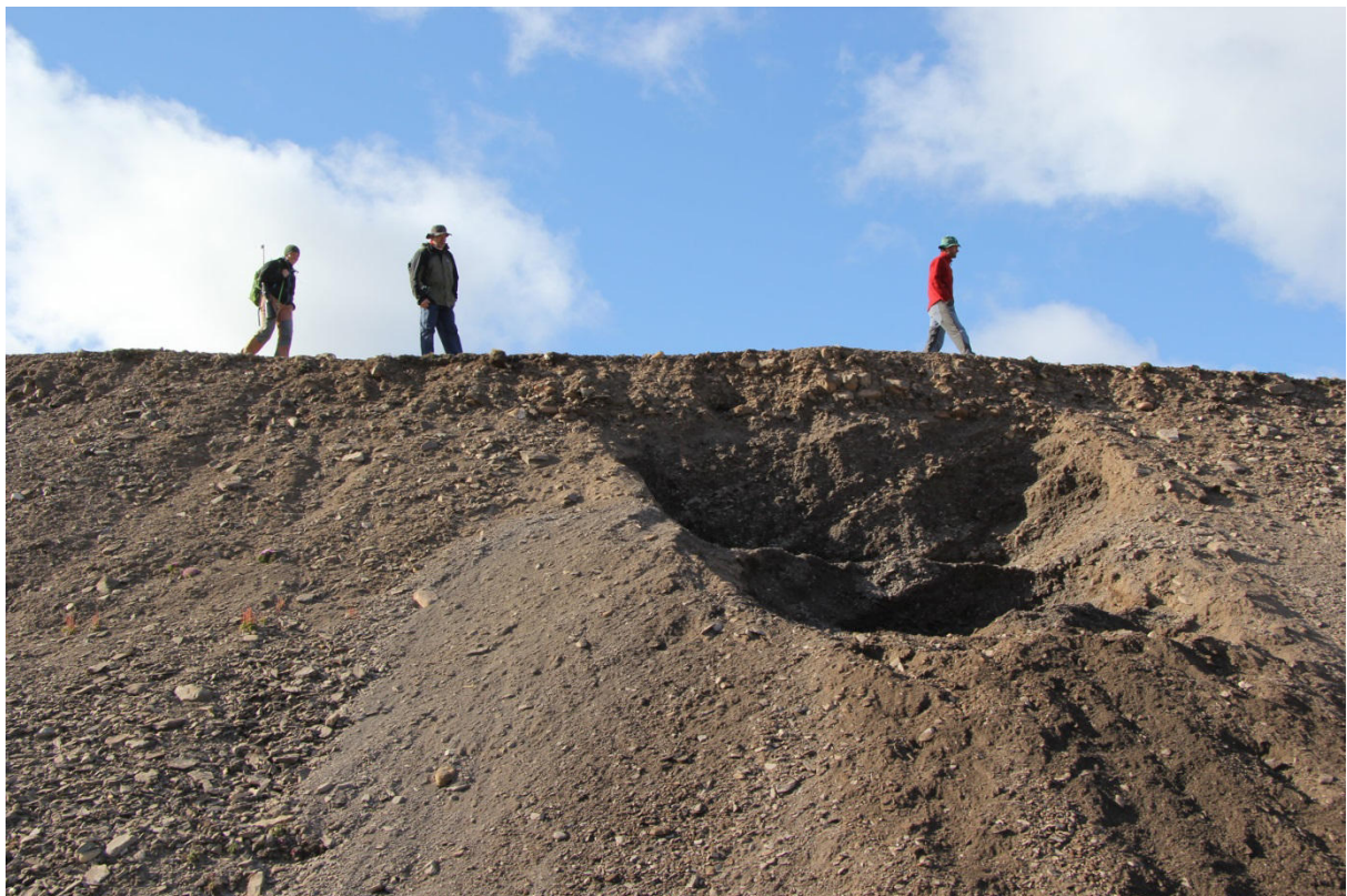
Research of the deltaic topset and foreset sediments, Mimerdalen