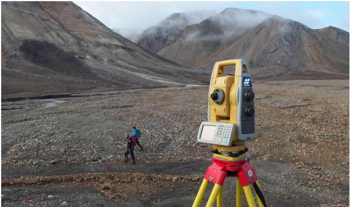
Elsabreen braidplain surface measurements using total station and differential GNSS instruments (photo Lenka Ondráčková).

4) Multitemporal changes of the Bertilbreen and Elsabreen braidplains using total station surveying, differential GNSS measurements and scanning by the unmanned aerial vehicle (drone).