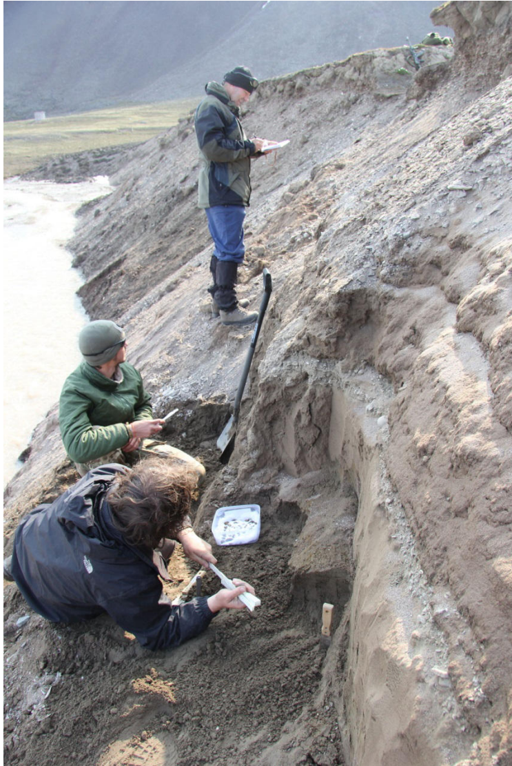
Documentation of the exposure in deltaic sediments and fossil collection, Mimerdalen

GEO research group has undertaken field excursions to the proglacial zone of Svenbreen (roche moutonnées, hummocky moraines), Hørbyebreen (supraglacial tills, esker facies), Ebbabreen (proglacial outwash fan) and Nordenskiöldbreen (roche moutonnées, fluted moraine).