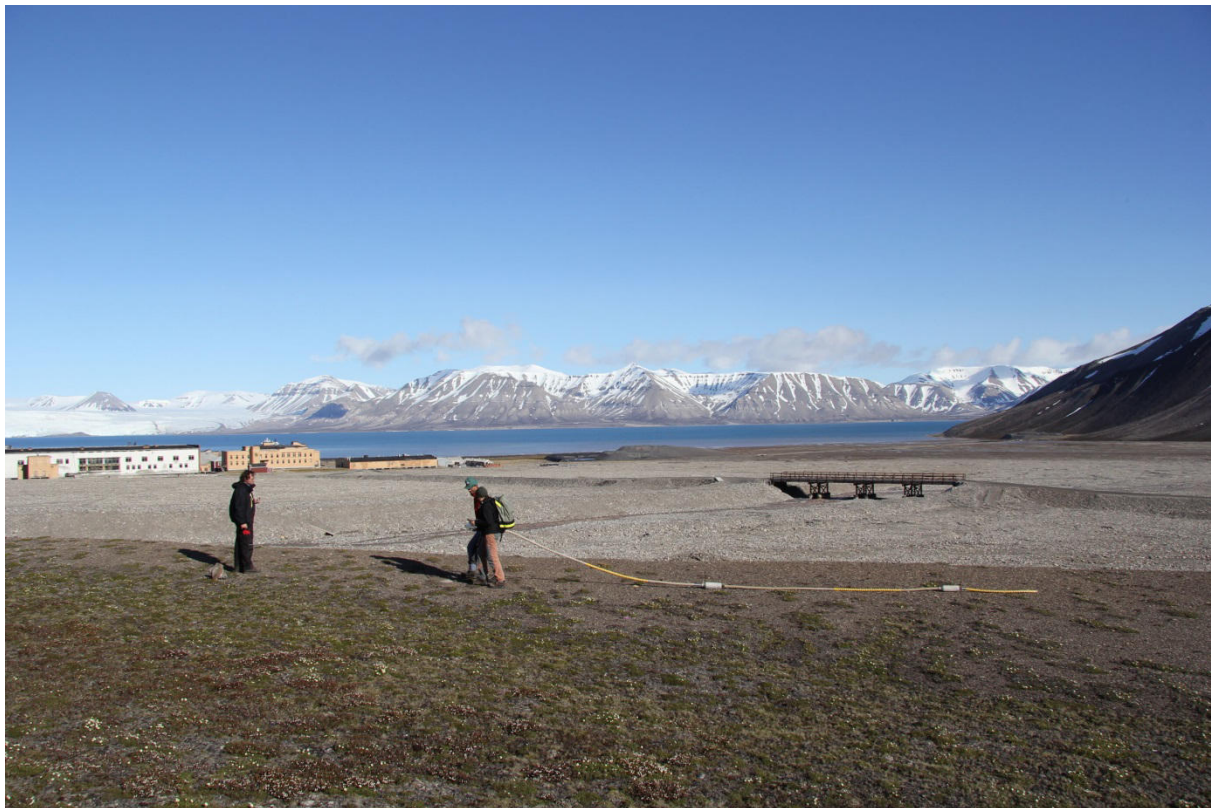
Ground penetrating radar survey for the assessment of the palaeodelta internal structure, Mimerdalen

Research of glacio-marginal early Holocene delta was conducted west of the abandoned mining town of Pyramiden, which lies in the direct neighbourhood of the Petuniabukta. A detailed ground penetrating radar survey has been undertaken at this site. The exposures were cleaned and the most interesting parts of the sedimentary successions were described. Ground penetrating radar survey was carried out also at two localities in Mimerdalen, where sedimentary logging and paleontological research was realized as well.