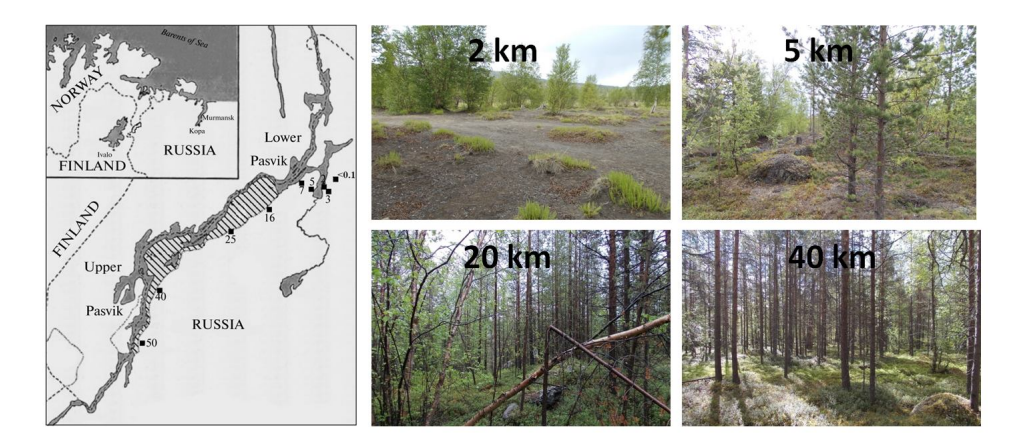
Fig. 1. Map (and photo) of the investigated area and sampling plots. The hatching shows the territory of the Pasvik reserve; the figures designate the distance from the Pechenganikel (km) plant.

cyanobacteria and Bold 3N liquid medium for algae and in Petri dishes with the same agarized culture media (Gaisina et al. 2008, Kotai 1972). Species were identified by morphological characteristics using a microscope Olympus CX 41 (Japan) with the camera Jenoptic ProgRes CT3 (Germany). For species identification a number of guides were used (Andreeva 1998, Ettl and Gärtner 2014. Komárek 2013). The species names and taxonomic affiliation were clarified by the electronic database AlgaeBase [1]. The similarity of the algae communities was analyzed using Sørensen-Chekanovsky coefficient (for average distance) in the GRAPHS program (Novakovskii 2004). The frequency of occurrence of algae species was calculated based on the following equation (Kondrat'eva and Kovalenko 1975, Kurakov 2001): B = (a/A) \times 100 , where B is occurrence (%); a is the number of samples containing the certain species, and A is the total number of the samples.