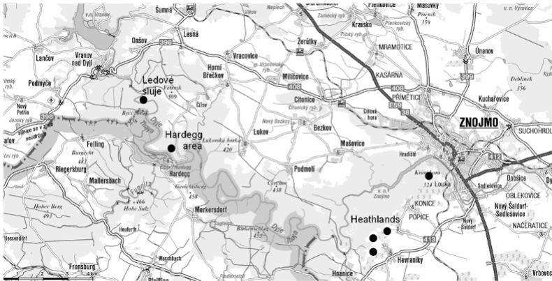
Podyjí National Park with indication of the sites to be visited

Podyjí National Park is situated in southwestern Moravia between the towns of Znojmo and Vranov nad Dyjí along the Czech-Austrian border. Austrian Thaya National Park is adjacent on the other side of the national border.