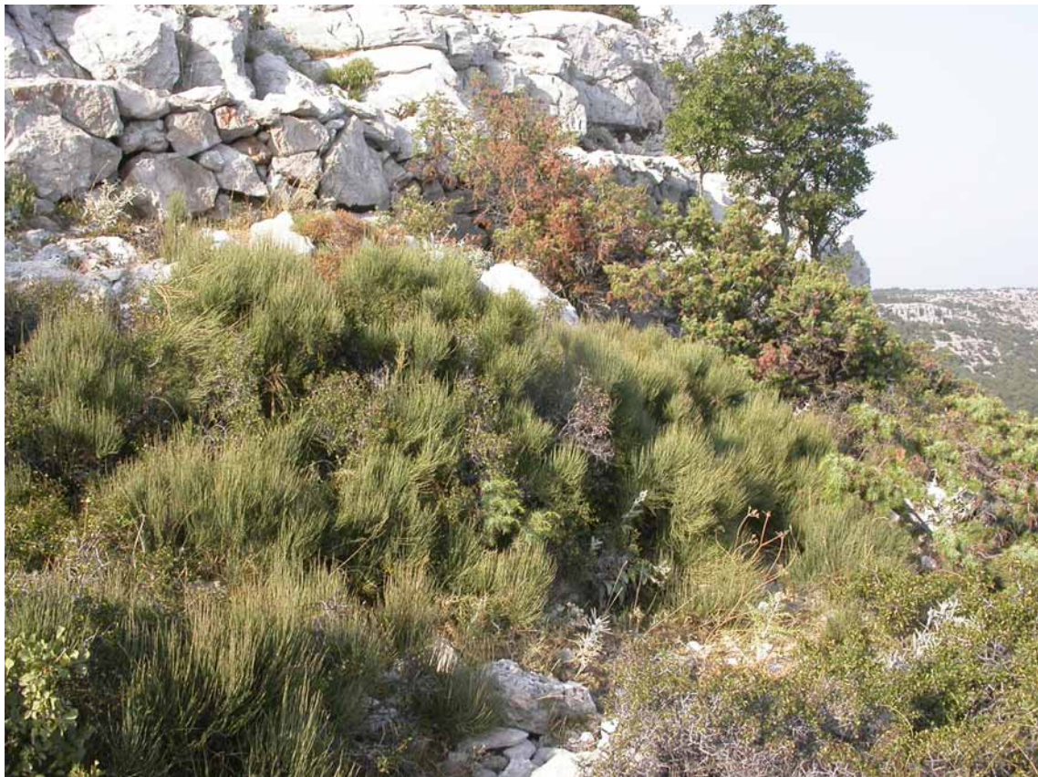
FIGURES 5–6. 5 (above) – Vidova Gora Mt. (top with the broadcaster; Croatia, Brač Is., 780 m a.s.l.) (Photo: Jitka Schlägelová, September 2005), 6 (below) – Ephedra distachya L. growth under the top of Vidova Gora Mt., the second known locality of Nasocoris lautereri sp. nov. (Photo: P. Kment, September 2004).