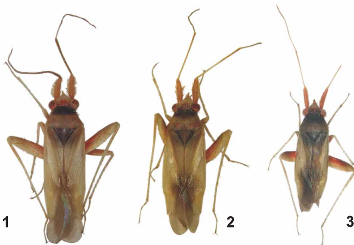
FIGURES 1–3. Nasocoris lautereri sp. nov., habitus. 1 – Male, holotype (Greece, Poros Isl.) (3.7 mm); 2 – Female, paratype (Greece, Poros Isl.) (3.6 mm); 3 – Female (Croatia, Brač Isl.) (3.1 mm).

2–4 ochraceous to pale brown, two apical segments generally darker. Thorax . Smaller anterior portion of pronotum dark brown, larger posterior portion pale ochraceous. Mesoscutum and scutellum brown. Propleuron pale ochraceous with a fuzzy reddish longitudinal stripe medially. Mesepisternum pale reddish, mesepimeron and metapleuron pale ochraceous, metathoracic scent gland peritreme ochraceous with slight reddish tinge. Legs . Coxae reddish, profemora and mesofemora reddish with ochraceous apices, metafemora pale ochraceous with indistinct small red spots and a basal reddish spot on anterior margin; tibiae ochraceous with more or less distinct dark brown punctures; tarsi ochraceous, slightly more infumated than tibiae, claws brown. Hemelytra pale ochraceous, basal portion of clavi (up to scutellar apex) and inner margin of corium between claval apex and membrane brownish. Membrane brownish fumous, veins concolorous. Abdomen pale ochraceous, pygophore apically slightly darker.